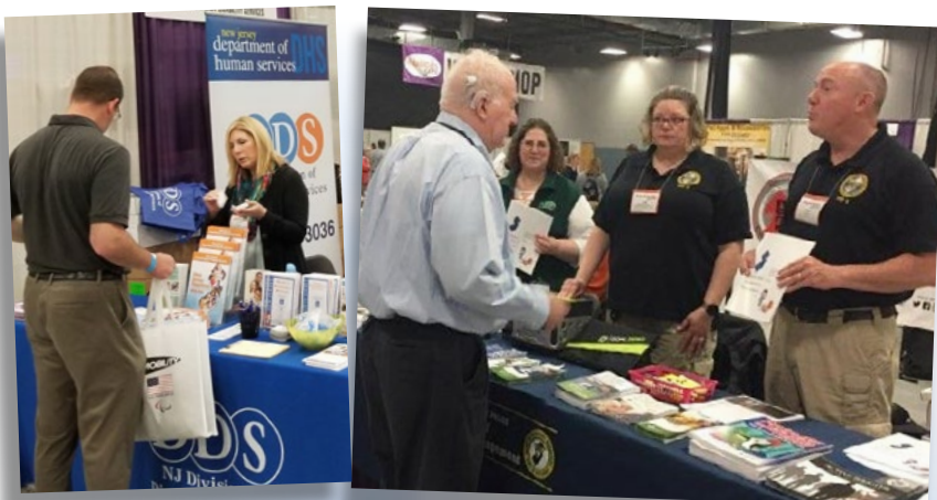
Human Services' Division of Disability Services and Office of Emergency Management met with residents at the Abilities Expo in Edison, highlighting the many services offered to individuals with disabilities.