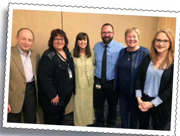
Deputy Commissioner Adelman (far right) met with the New Jersey Council on Developmental Disabilities, parents and advocates to discuss Governor Murphy's proposed new investments to care for individuals with developmental disabilities, including those with co-occurring behavioral health needs.