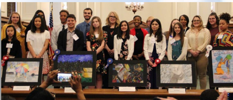
Human Services honored 16 New Jersey high school and middle school students for their winning entries in the 2019 New Jersey Child Support Teen Media Contest, which celebrated the artistic and written portrayal of situations when the students felt most supported by a parent or loved one.