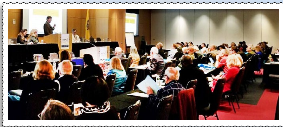
Human Services had an important discussion with the Medical Society of New Jersey about Murphy Administration's efforts to support physicians providing medication-assisted treatment for opioid addiction.